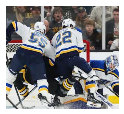
St. Louis Blues vs. Colorado Avalanche

Date: April 5th <u>Time:</u> 6:00 p.m. <u>Location:</u> Enterprise Centre -Stl, MO <u>Price:</u> $28+ The St. Louis Blues will play against the Colorado Avalanche at the Enterprise Center. It's a regular-season NHL matchup between these two competitive teams. <u>LINK</u>