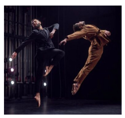
Saint Louis Dance Theatre - Tour de Dance

Date: March 26th <u>Time:</u> 6:30 p.m. <u>Location:</u> The Pageant - Stl, MO <u>Price:</u> $39.50+ Kim Dracula & HANABIE are bringing high-energy metal with Kaonashi and Crystal Lake! Expect heavy riffs, intense vocals, and unforgettable performances. <u>LINK</u>